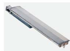
Burner Units Heavy-duty, 11 gauge 304 stainless steel.