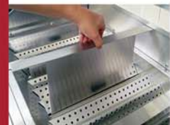
Flame Directors Adjustable panels for creating cooking zones.