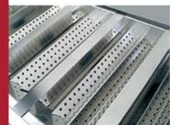
Flavor System Distributes heat for even cooking & reduced flareups. Can add flavor brickettes for additional flavor.