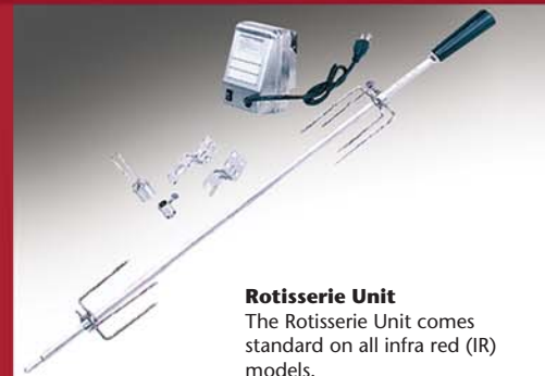
Rotisserie Unit The Rotisserie Unit comes standard on all infra red (IR) models.