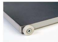
Roll-along Tray Easily removable drip tray for quick cleaning.