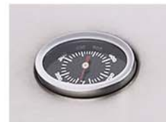
Temperature Gauge Gives grill temperature for controlled cooking.