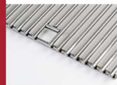
Heavy-duty Grate 3/8" 304 stainless steel cooking grate.